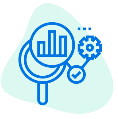
Budget Impact of Digital Programs

Quality Metrics Impact of Digital Interventions